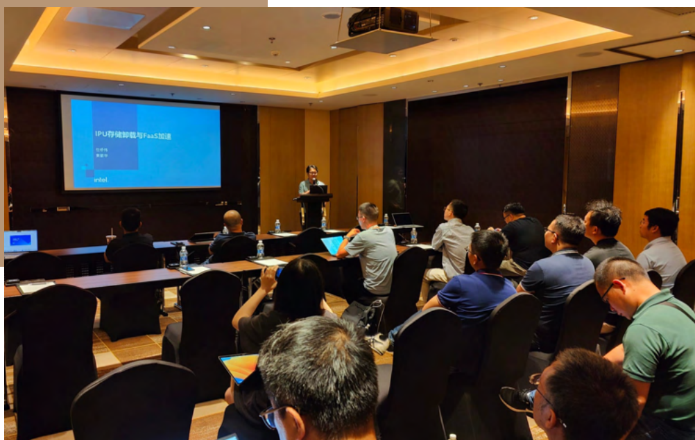
Qiaowei Ren, Cloud Native Software Architect, Intel on IPU Storage Offloading and FaaS Acceleration [云原生软件架构师 任桥伟 IPU存储卸载与FaaS加速]